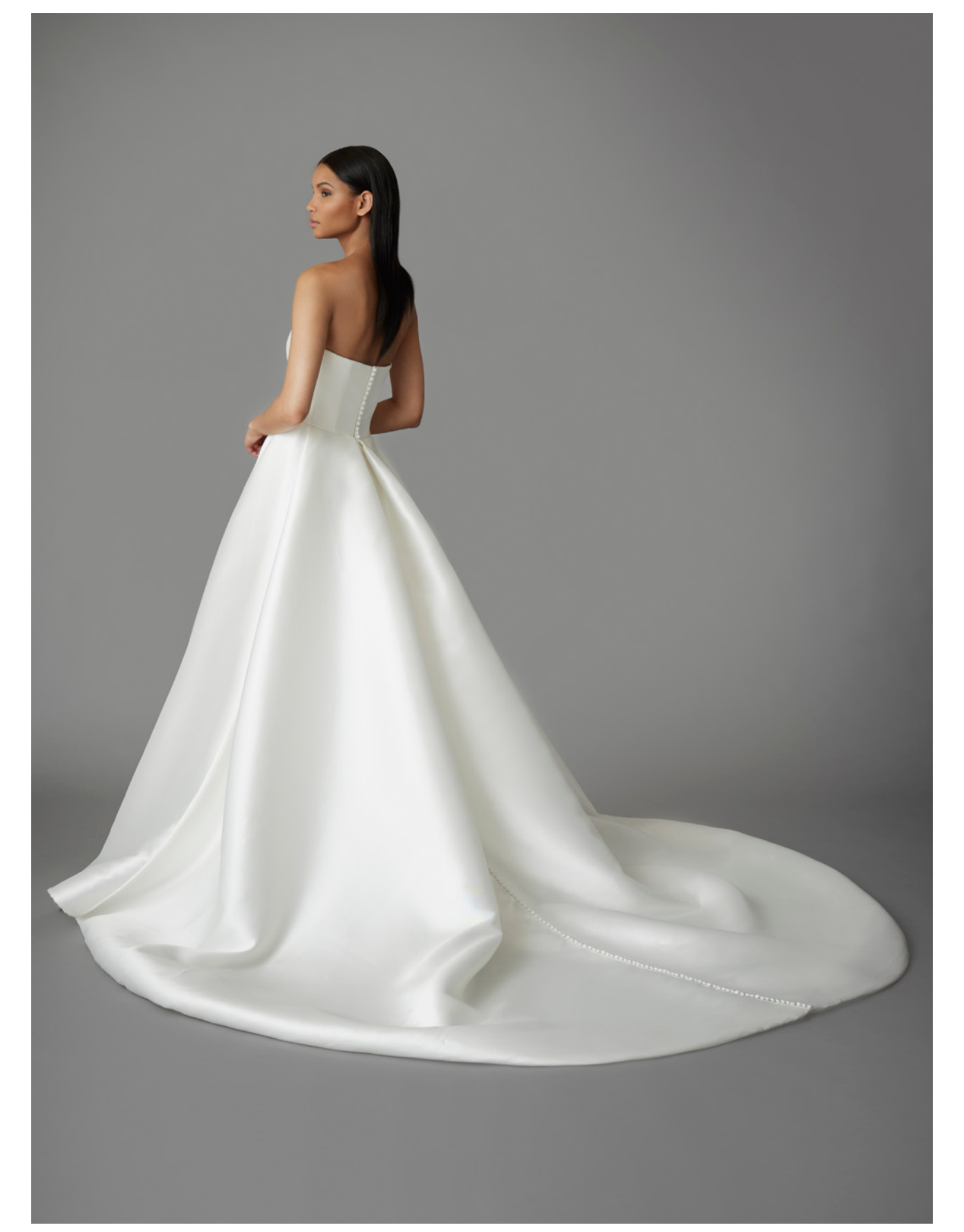
SHERIDAN || 42250