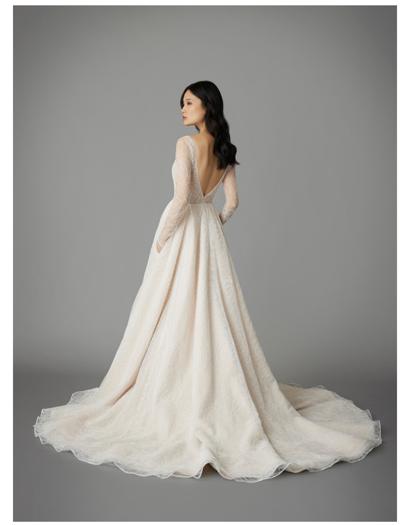
YARDLEY || 42260