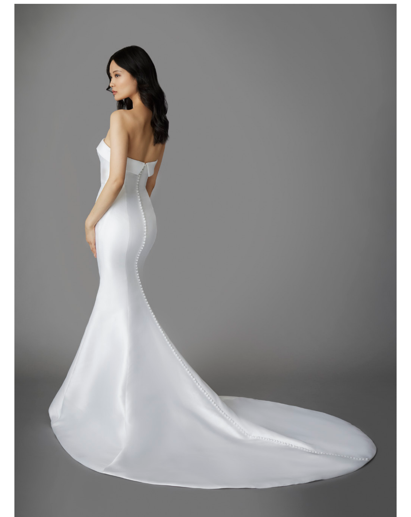
LEIGHTON || 42256